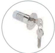
Panic Device Cylinder 164YNO00001