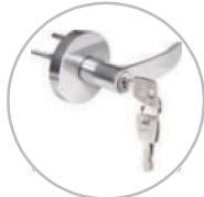
Panic Device Handle KD040/30-291